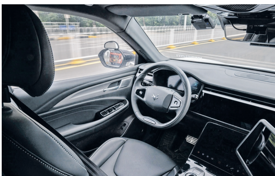
Apollo Go completed 3.4 million driverless rides in the fourth quarter of last year.

The police said preliminary findings indicated that the incidents were caused by a system failure. All passengers safely exited the vehicles and there were no injuries, the